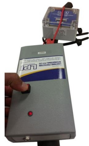
Figure 5: Step 3