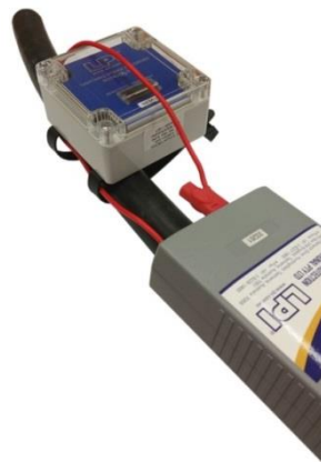
Figure 4: Step 2