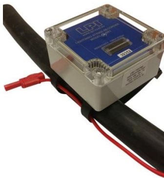
Figure 3: Step 1